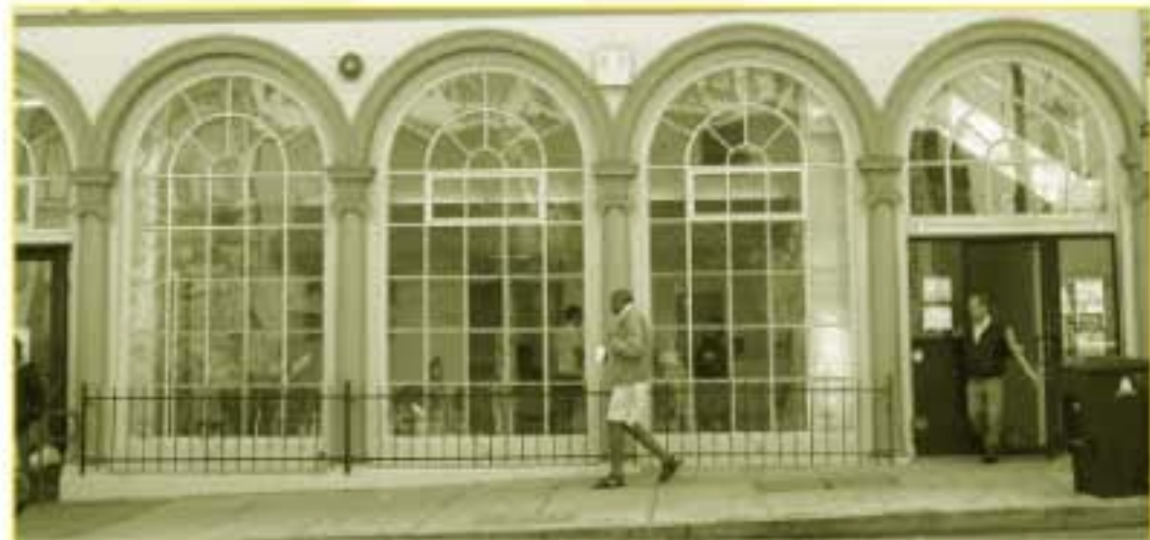
Curry Senior Center today (formerly North of Market Senior Services) 333 Turk Street, San Francisco, California, 94102

Today, Curry Senior Center continues to bring health, hope, and dignity to San Franciscans over 55 who live in the City's Tenderloin and South of Market regions.